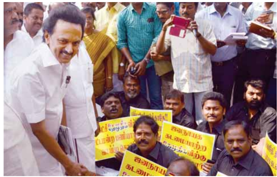
DMK treasurer MK Stalin and party MLAs interact with suspended DMDK MLAs, demanding to be allowed to attend the State Budget Session, at Secretariat in Chennai on Wednesday