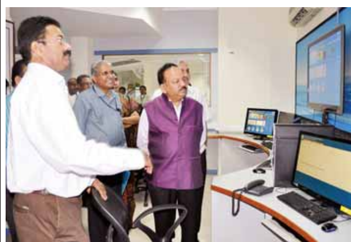
Union Minister for Science and Technology Harsh Vardhan at NIOT in Chennai on Wednesday

The PROVE is being deployed at India's base camp at Antarctica for collecting the parameters required in forecasting Monsoon. As on date scientists depend on Mathematical models for forecasting the Monsoon which many times vary from initial forecasts.