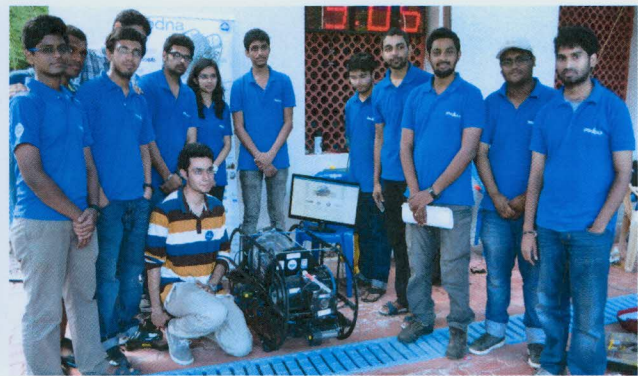
Team of SRM University and AUV