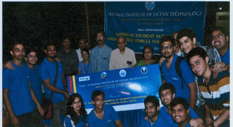
SRM University won the competition