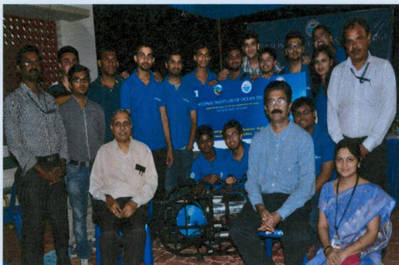
SRM University won the competition